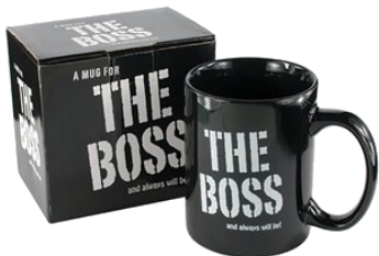
Be Your Own Boss