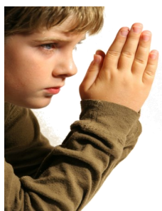
Priorities & Values