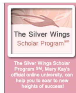
Training & More Training