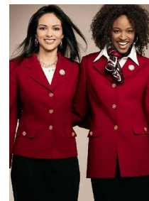
Fun & Friends