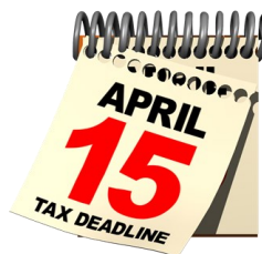
Tax Advantages (Consult a tax professional)