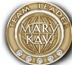
Advancement (You decide when)